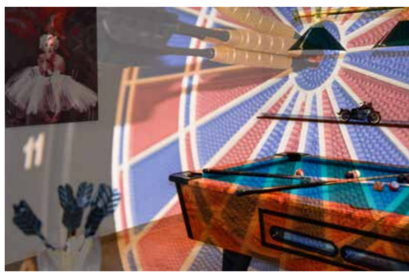
Common room with pool, darts and tabletop football. Use for a fee.

All rooms are equipped with shower or bathtub, toilet, cable TV, blow-dryer, telephone, safe and minibar.